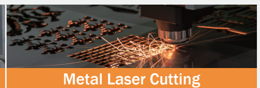
Metal Laser Cutting