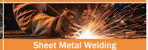
Sheet Metal Welding